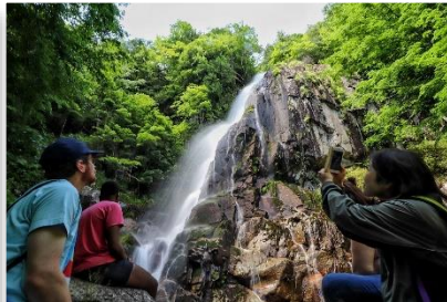
Okura Falls Prefectural Nature Park