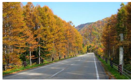
The perfect place for a drive