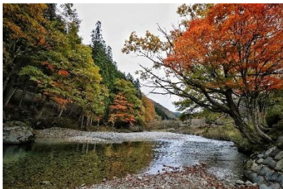
Many beautiful stops along the way